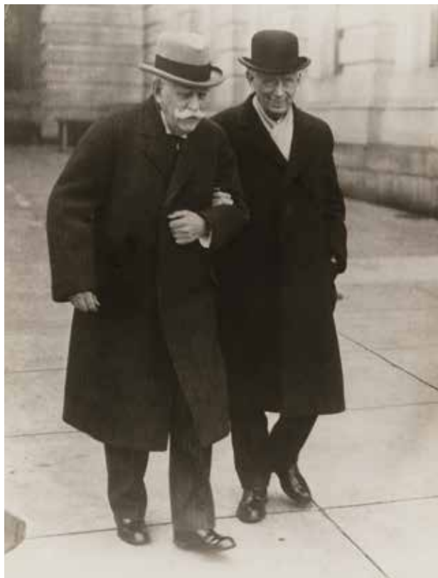
Holmes in his mid eighties: posing in 1926 with William Howard Taft, third of the four chief justices under whom he served (above), and strolling circa 1927-1928 with his friend and fellow associate justice Louis Brandeis