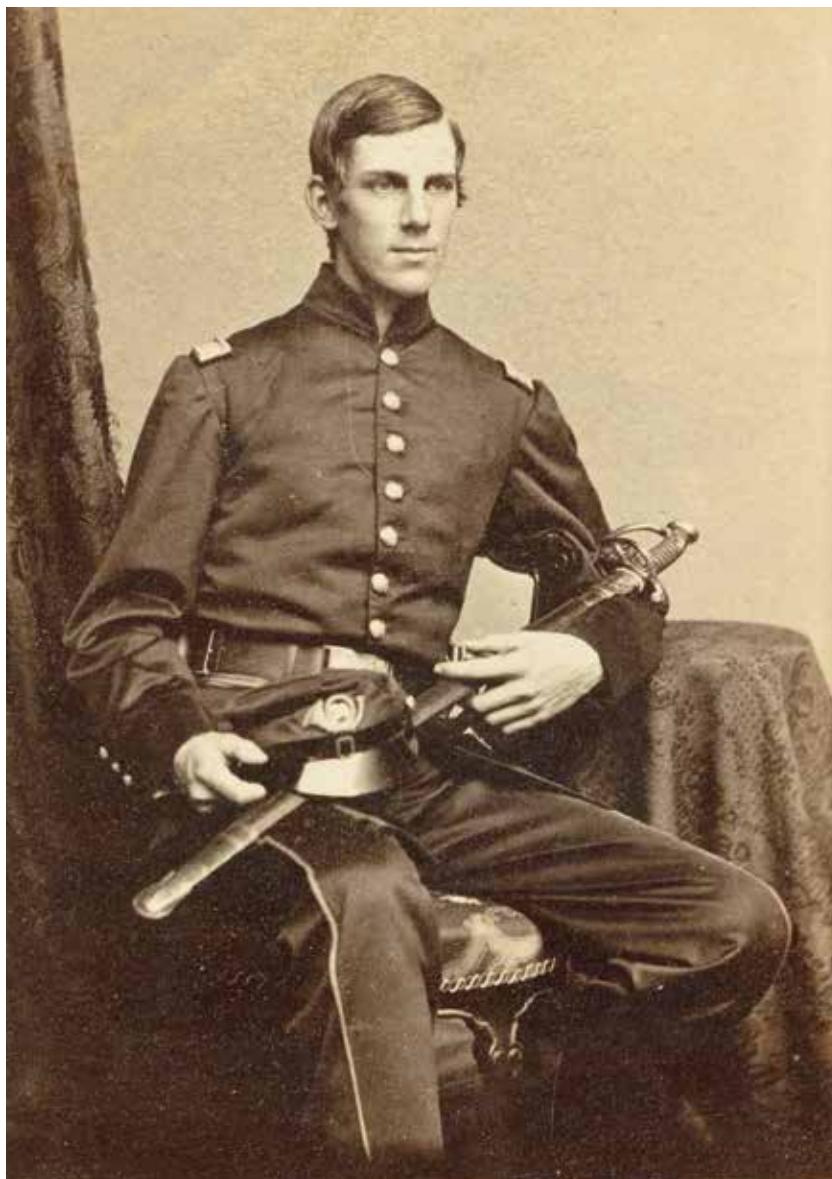
After graduating from the College in 1861, Holmes obtained a commission as first lieutenant in the Twentieth Massachusetts Volunteer Infantry, known as the “Harvard Regiment.”

MANY SCHOLARS have contended that Holmes was a cynic—icy and aloof, mean-spirited and dark, and supremely self-centered. To Budiansky, the Civil War made Holmes a skeptic —doubting and fatalistic—but not a cynic: it made him question “the morally superior certainty that often went hand in hand with belief: he grew to distrust, and to detest, zealotry and causes of all kinds.” It also helped make him charming, exuberant, and very ambitious, searching, open-minded, and unquenchable. As he put it in a letter to a friend: “My old for-